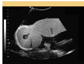
Reference markers ensure repeatable measurements of AC and BPD.