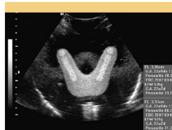
Longitudinal measurements of femur length