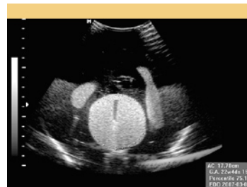
Cross section demonstrating measurement of AC.