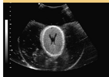
Cross section measuring BPD.