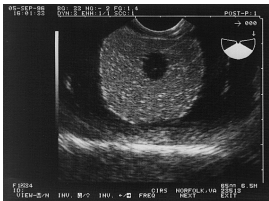
Normal Ultrasound Image

3 embedded isoechoic lesions, 1 cm diameter randomly placed.