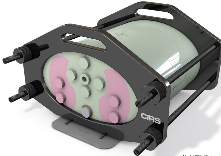
Model 002LFC showing optional water equivalent rod with ion cavity